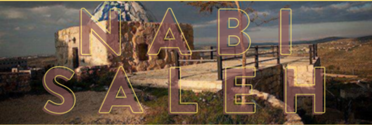
We're building a world where Palestine is liberated and all are free

This month's newsletter focuses on the village of Nabi Saleh. With its approximately 650 inhabitants, Nabi Saleh is situated about 20 km (12 mi) northwest of the city of Ramallah in the West Bank. The small town that's drawn attention for its unrelenting Friday protests sits atop a mountain with clear views of the Palestinian coast and other surrounding areas. Despite the risks and constant attacks on Palestinians by occupation forces, village residents, joined by international activists and journalists, venture out in the spirit of Palestinian resistance every Friday for demonstrations to defend their main water source, which has become threatened by the nearby Halamish settlement since 2009. It is cherished in the hearts of its residents for its lush agricultural lands, forests, olive and pine trees, and water springs, and boasts beautiful archaeological and tourist sites.